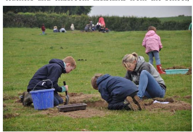
Young archaeologists at Stiances

With the aid of professional archaeologists, teachers and classroom assistants from the school,