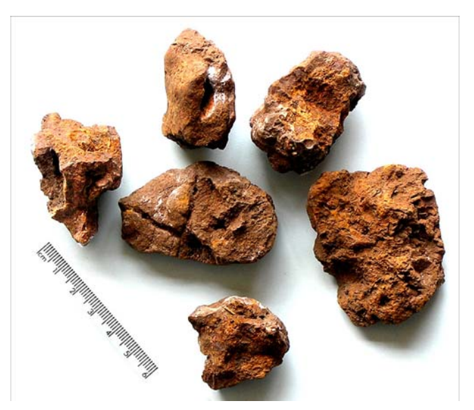
Slag found on the South Downs near Alfriston

An iron ore, Iron Sulphide (Marcasite FeS<sub>2</sub>), is found as isolated nodules in the Middle Chalk, either spherical or rod-shaped. As these nodules are not found in a mass it is difficult to find a useful amount unless a rock-falls occur on a beach, such as the cliffs west of Eastbourne, Sussex.